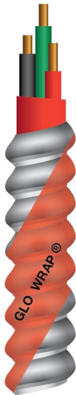
(2 conductor shown)