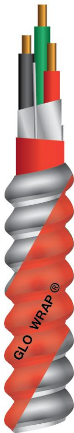
(2 conductor shown)

Conductor: Bare solid soft drawn copper Insulation: Thermoplastic (105°C dry) Bonding Conductor (Ground): 1 solid insulated copper conductor Shield: Overall aluminum foil shield with tinned 22 AWG drain wire Jacket Red PVC rated 105°C Armour: Aluminum interlocked armour Steel interlocked armour (available upon Request) Colour Coding: 3 Conductor Black/Red/Green 5 Conductor Black/Red/Blue/Brown/Green Speciality colours available upon request