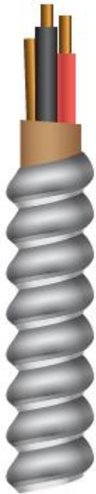
(2 Conductor shown)

BLACK, RED XLPE/ALUMINUM ARMoured/600 V, (-40°C) CSA